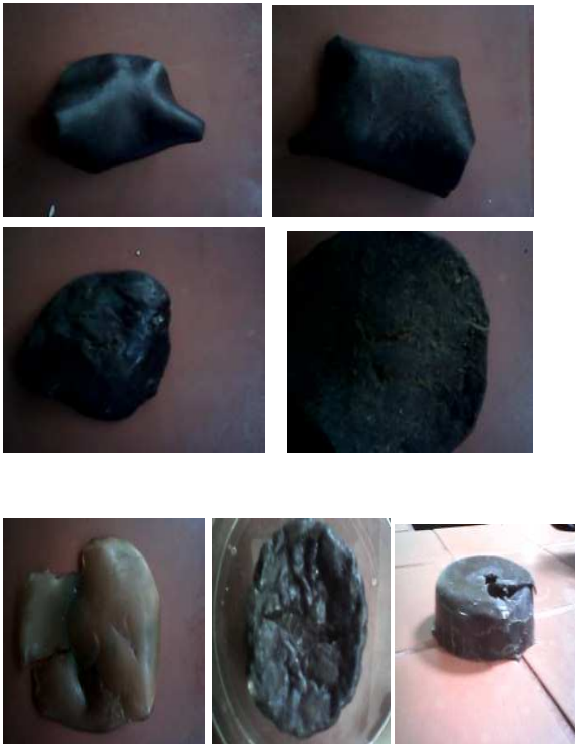
Fig.1: Photographs of Bioplastic obtained from Sweet Potato Starch and Algae.